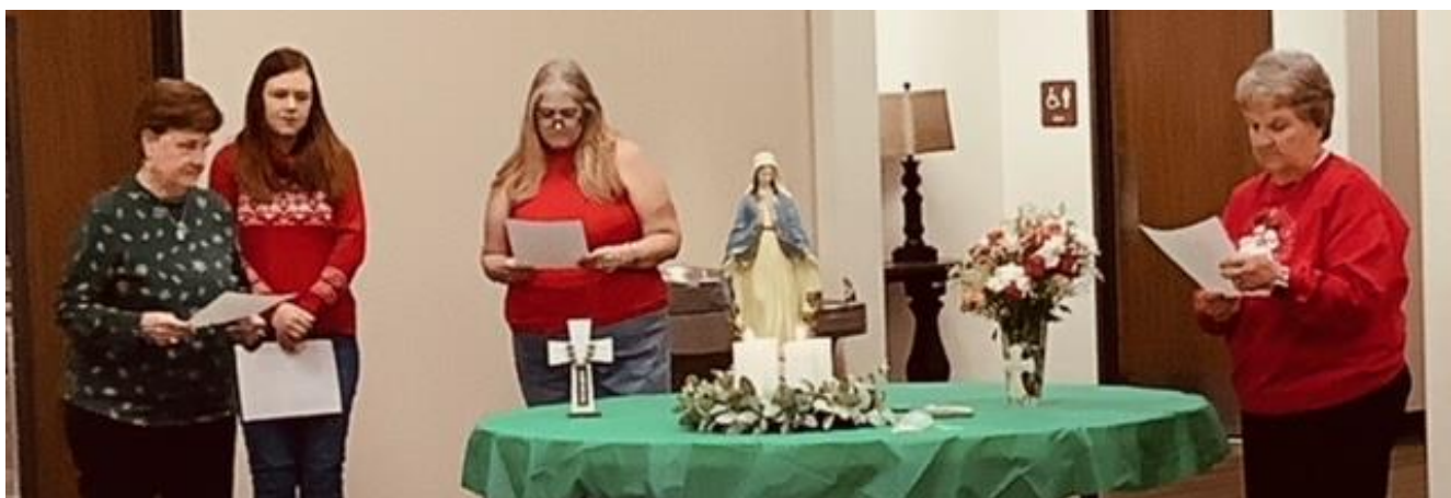
Above - L-R